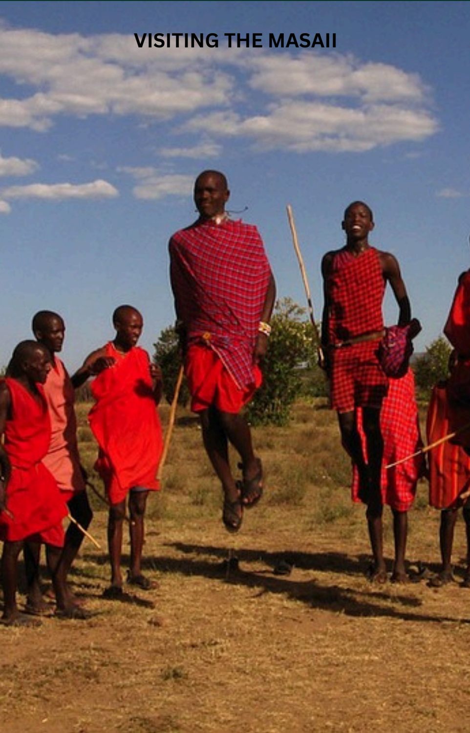
VISITING THE MASAI

Choosing African Moto Adventures means riding with a team that lives and breathes the spirit of exploration. AMA was built for riders who don't just want a holiday — they want immersion, connection, and discovery on two wheels.